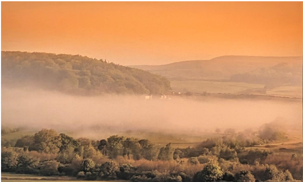
Early morning over Burbage